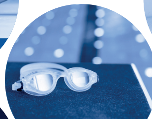
Public swimming pools